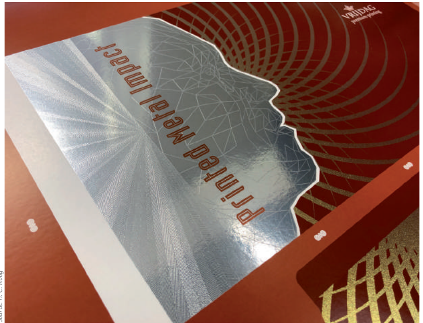
With the Moog sheet-fed gravure press, impressive effects can be achieved

nal console, which allows the operator to fully control the entire sheet-fed gravure process, including all press settings and remote adjustment, as well as offering instant job recall for repeat work. The computer also reads sensors on the